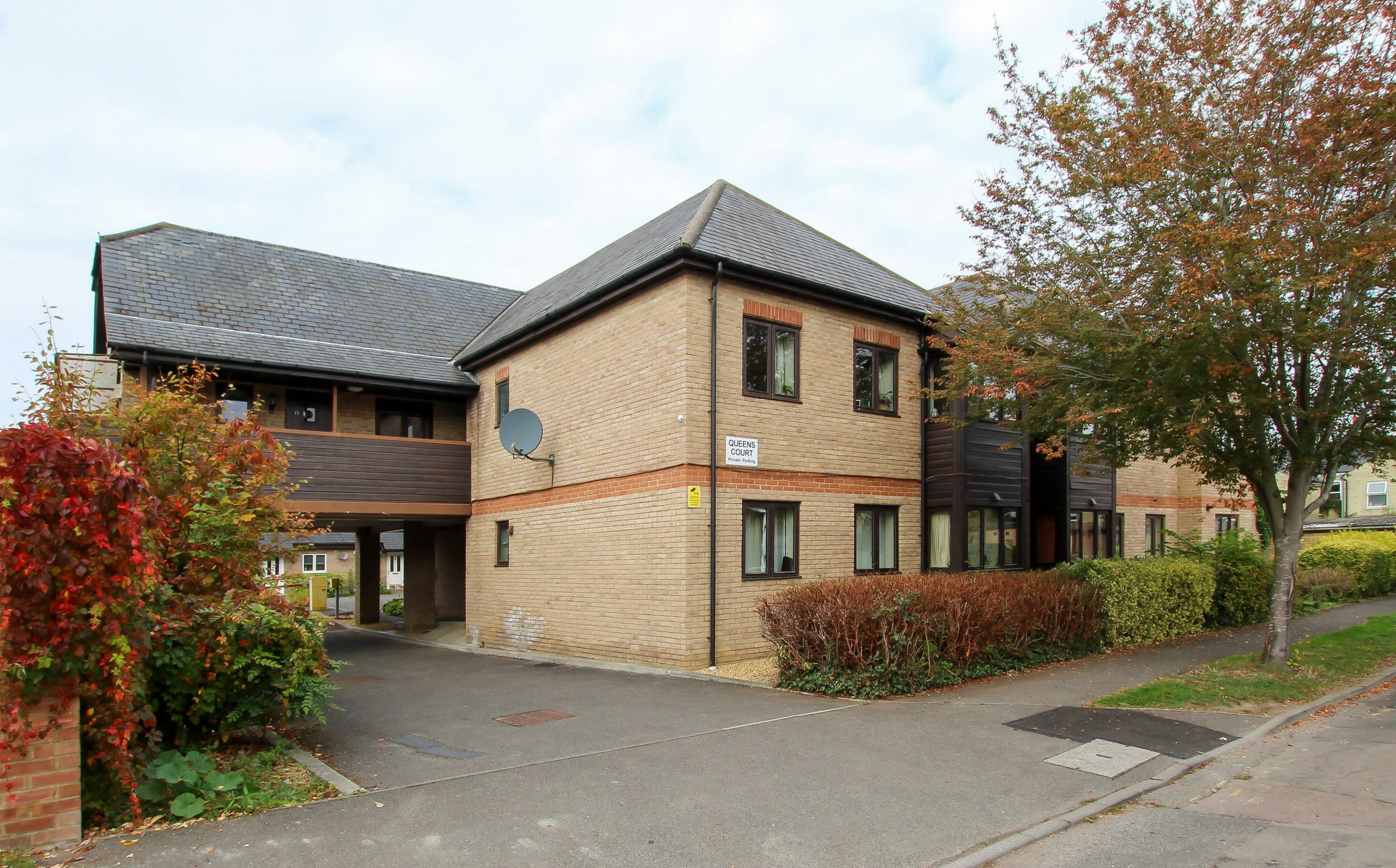
Queens Court, St. Margarets Square, Cambridge, CB1 8AQ